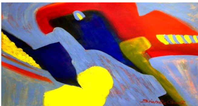
Fig. 2 "Shifting Memories " by Bianka Guna , Acrylic on Paper , 22"x30" ©Bianka Guna 2017