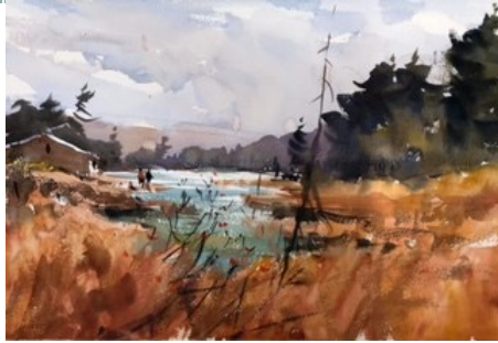
Art Cunanan “Loosen Up with Watercolour”

This dynamic workshop will help you to “loosen up” your watercolours. Amazing demonstrations from sketches to finished paintings will guide you on your journey.