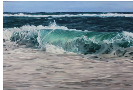
Susan Outlaw “Waterscape in Oils”

Understanding waters reflections, colouring and transparent quality is key to painting a realistic waterscape.